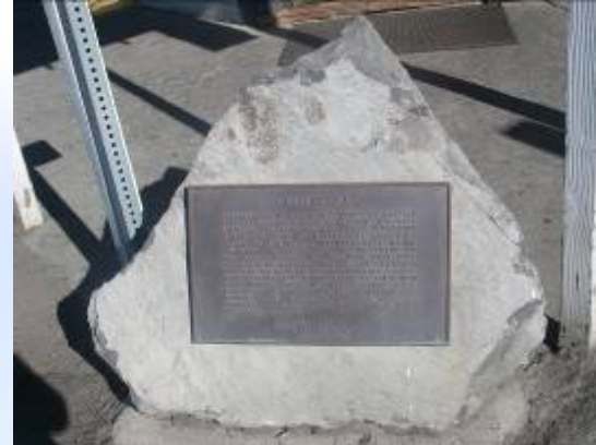
Thompson's Saloon + Historic Placard