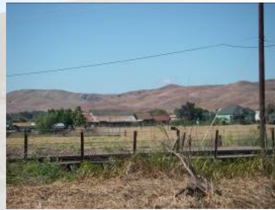
The Livery Stable + Farm Houses